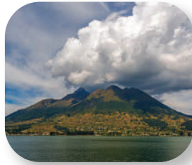
San Pablo Lake Imbabura