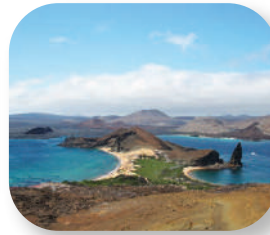
Galápagos beaches and submarine platform