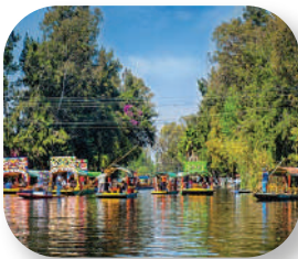
Xochimilco Lake México