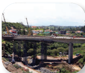
San Pedro River Quito