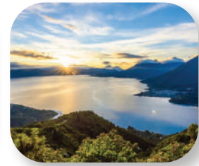
Atitlán Lake Guatemala