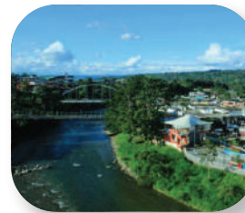
El Tena Ecuador