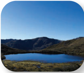
Cajas Lagoon Cuenca - Ecuador

The areas to be intervened will be: San Pablo Lake (Imbabura), Danube River (Serbia), Xochimilco Lake (Mexico), Atitlán Lake (Guatemala), Cajas Lagoon (Cuenca), San Pedro River (Quito), Galápagos beaches and submarine platform