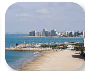
Beach of Salinas Ecuador