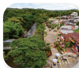
El Puyo Ecuador