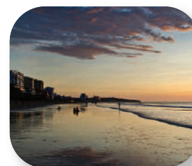
Beach of Manta Ecuador